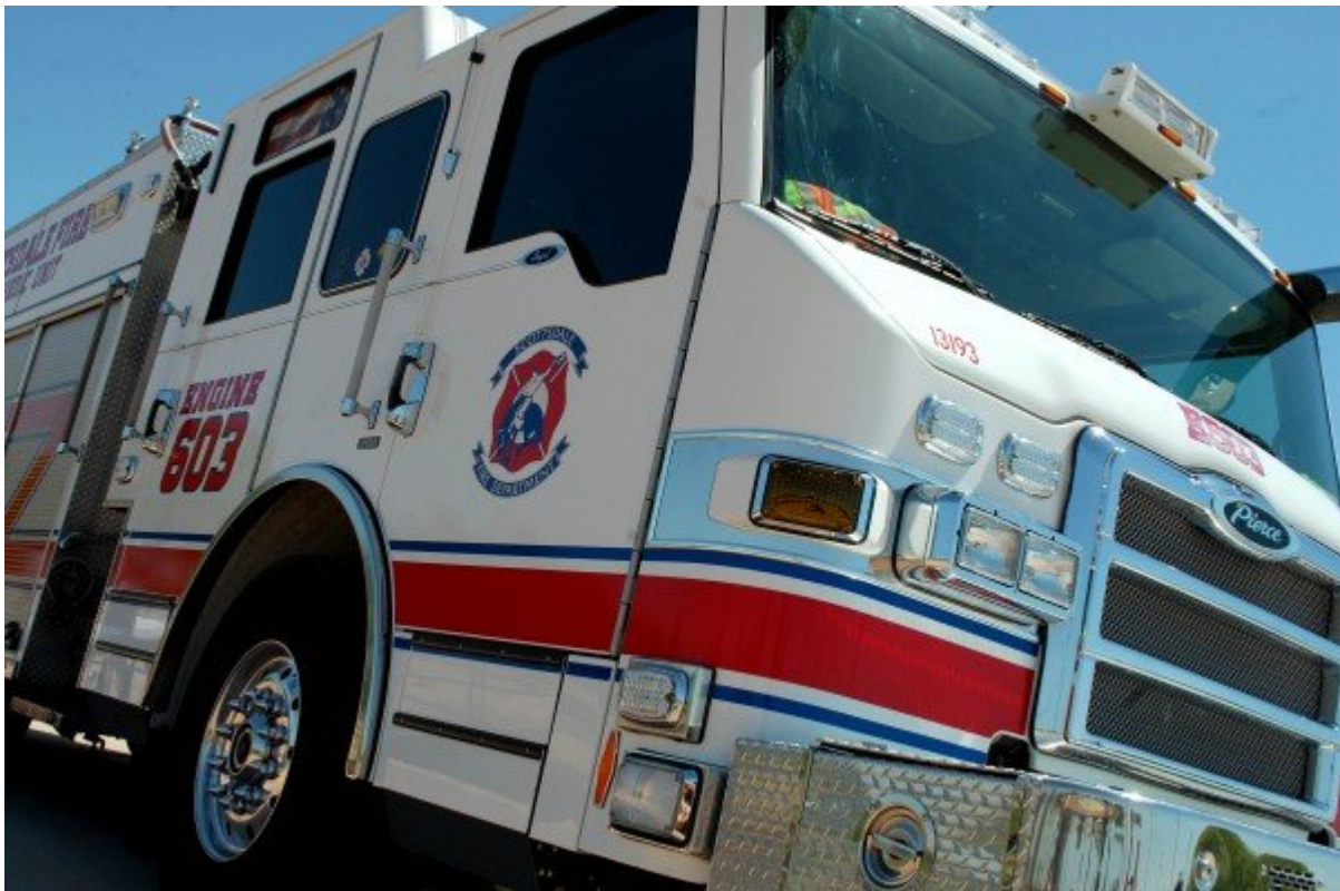
(/uploads/original/20191023-185826-Scottsdale Development (Fire Truck).jpg)